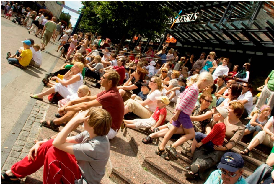
Pedestrian street.

In Jyväskylä there is a lot to see and do. The real pearl is the city's pedestrian precinct , the fun heart of the city, the venue where residents of the city as well as visitors come to see and be seen. It is flanked by shopping centres, boutiques, giftware stores with Finnish craft products, cafés, restaurants, pubs, and much more besides.