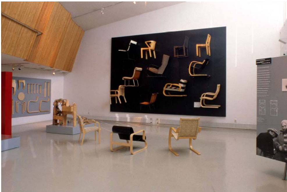
Alvar Aalto -museum Permanent exhibition Alvar Aalto. Architect. Owned by Alvar Aalto -museum.

Local cultural treasures include two unique UNESCO world heritage sites: Petäjävesi Old Church and Oravivuori triangulation tower. Completed in 1765, Petäjävesi Old Church is a wonderful example of beautiful and durable wooden construction. In Korpilahti, at the top of Oravivuori, lies Oravivuori triangulation tower, one of Finland's six points in the Struve chain.